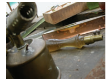
Lorrie Stock - Glass tools, spirit level and hand saw