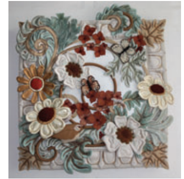
Julie Willoughby - Embroidery

Textiles and felt are another popular material within the group, some members using felt to create garments such as waistcoats, jumpers and hats while other create wall hangings, decorative and household objects such as candle holders and vessels. Other textile artists create both hand and machine embroidery pieces, wall hangings and playful pieces often with appliqué additions. This is just a sample of the materials and techniques covered by the members of the network, we are constantly looking to expand and explore new and different materials and techniques, the group also has woodworkers, blacksmiths and in the past, leatherwork.