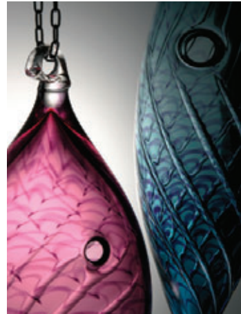
Lynn Baker - Blown glass forms

The group has a number of ceramicists also working with thrown ceramics, substantial hand-building, delicate coiling, intricate glazing techniques, smoke firing and raku, and with the incorporation of found objects the variety of work produced is large.